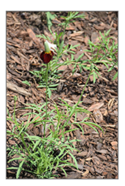
Red Midget Mexican Hat in bloom