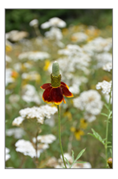
Red Midget Mexican Hat flowers

Red Midget Mexican Hat is recommended for the following landscape applications;