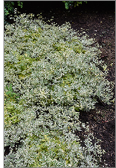
Golden Feathers Jacob's Ladder foliage

Golden Feathers Jacob's Ladder is recommended for the following landscape applications;