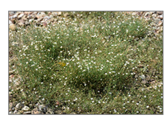
Tunic Flower in bloom

A spreading, mat forming variety that is dotted with flowers in spring to mid-summer; spring flowers are white but transition to pink in summer; looks great cascading over walls, or as a rock garden accent; mulch root zone to retain soil moisture