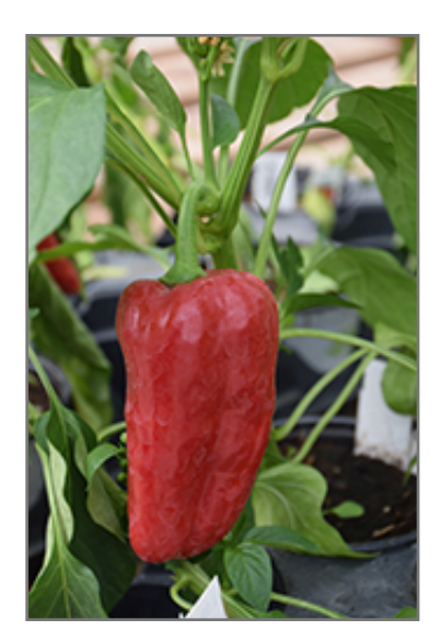
Super Shepherd Pepper fruit

A wonderful upright variety producing high yields of large, sweet peppers; developing from green to dark red, these sweet and crunchy peppers with thick walls are perfect for stuffing, grilling or frying; a great variety for freezing