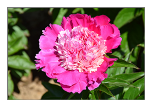
Madame Emile Debatene Peony flowers