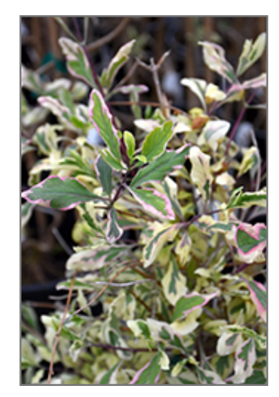
Harlequin Honeysuckle foliage