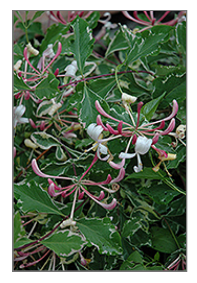
Harlequin Honeysuckle flowers

Harlequin Honeysuckle is recommended for the following landscape applications;