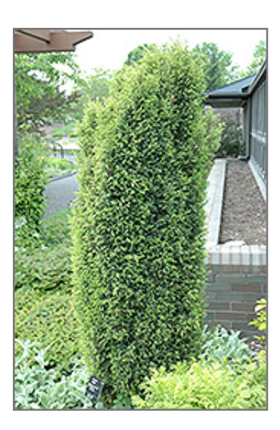
Gold Cone Juniper