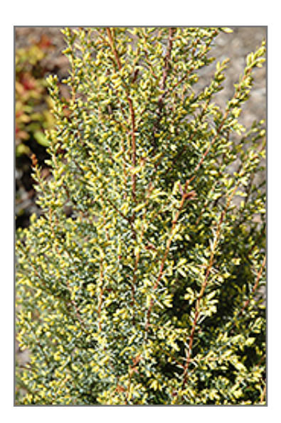
Gold Cone Juniper foliage