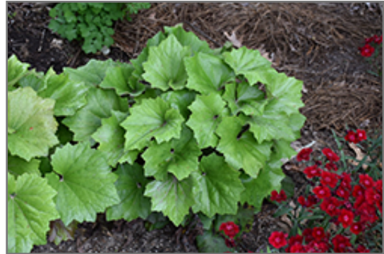
Last Dance Rayflower