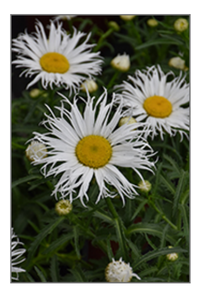
Sweet Daisy Cher Shasta Daisy flowers