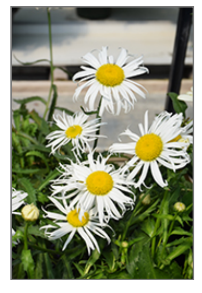
Sweet Daisy Cher Shasta Daisy flowers

This plant will require occasional maintenance and upkeep, and should be cut back in late fall in preparation for winter. It is a good choice for attracting butterflies to your yard. Gardeners should be aware of the following characteristic(s) that may warrant special consideration;