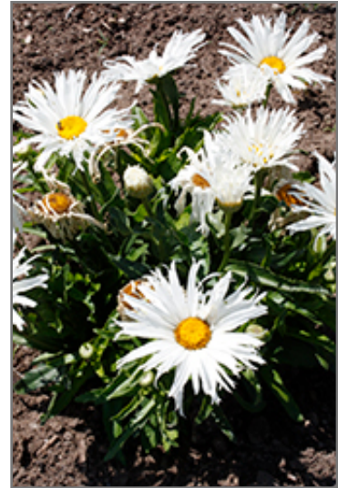
Amazing Daisies Spun Silk Shasta Daisy flowers