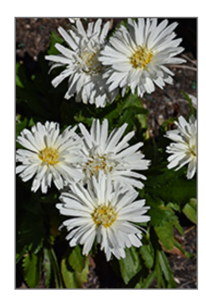
Mt. Hood Shasta Daisy flowers