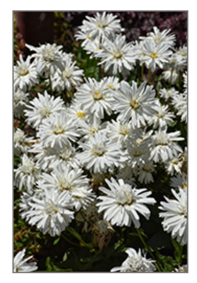
Mt. Hood Shasta Daisy flowers

Mt. Hood Shasta Daisy is recommended for the following landscape applications;