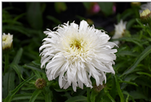
Amazing Daisies Marshmallow Shasta Daisy flowers

This plant will require occasional maintenance and upkeep, and should be cut back in late fall in preparation for winter. It is a good choice for attracting butterflies to your yard. Gardeners should be aware of the following characteristic(s) that may warrant special consideration;