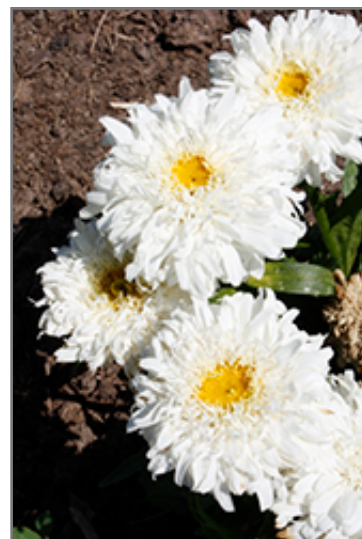
Amazing Daisies Marshmallow Shasta Daisy flowers