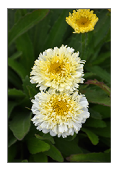
Luna Shasta Daisy flowers