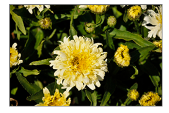
Ice Cream Dream Shasta Daisy flowers

Ice Cream Dream Shasta Daisy is recommended for the following landscape applications;