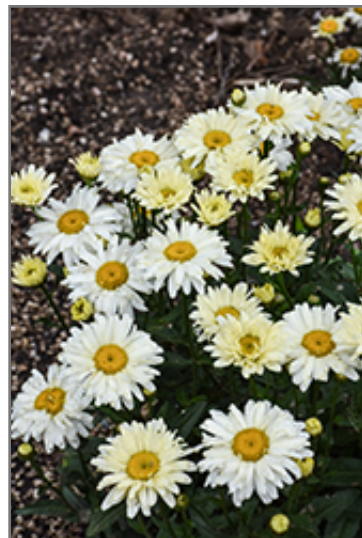
Amazing Daisies Banana Cream II Shasta Daisy flowers