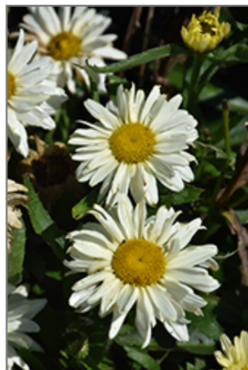
Amazing Daisies Banana Cream II Shasta Daisy flowers