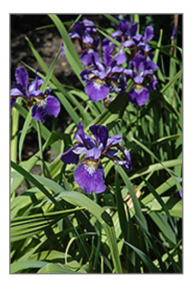
Tealwood Siberian Iris flowers

Tealwood Siberian Iris has masses of beautiful powder blue flag-like flowers with harvest gold throats and royal blue falls at the ends of the stems in mid spring, which emerge from distinctive navy blue flower buds, and which are most effective when planted in groupings. The flowers are excellent for cutting. Its sword-like leaves remain green in colour throughout the season.