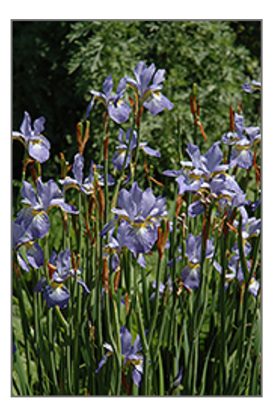
Gatineau Siberian Iris in bloom

Gatineau Siberian Iris has masses of beautiful sky blue flag-like flowers with gold throats and a white beard at the ends of the stems in late spring, which emerge from distinctive blue flower buds, and which are most effective when planted in groupings. The flowers are excellent for cutting. Its sword-like leaves remain green in colour throughout the season.