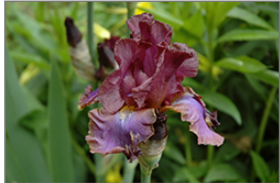
Cantina Iris flowers

Cantina Iris has masses of beautiful fragrant violet flag-like flowers with royal blue streaks at the ends of the stems in mid spring, which are most effective when planted in groupings. The flowers are excellent for cutting. Its sword-like leaves remain green in colour throughout the season.