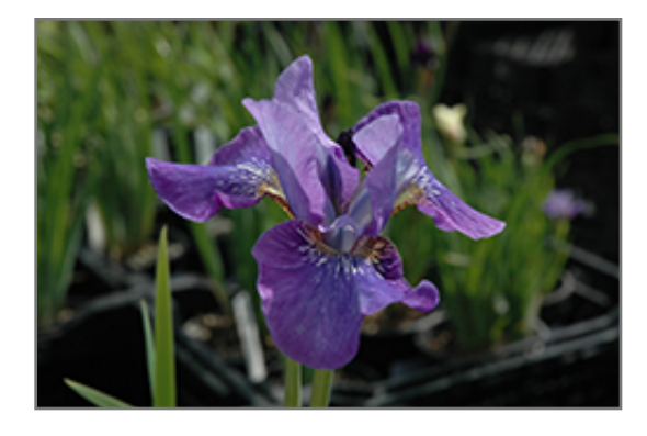
Backstage Siberian Iris flowers