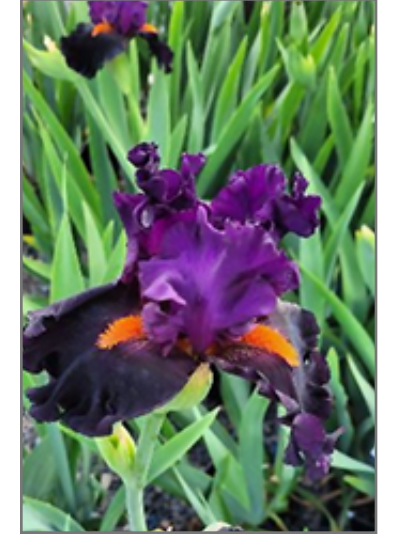
Sharp Dressed Man Iris flowers

This elegant iris features deep violet-black falls and purple standards, with brilliant orange beards for contrast; a stunning addition to the perennial border; also excellent massed in groupings in the garden; will quickly form dense colonies