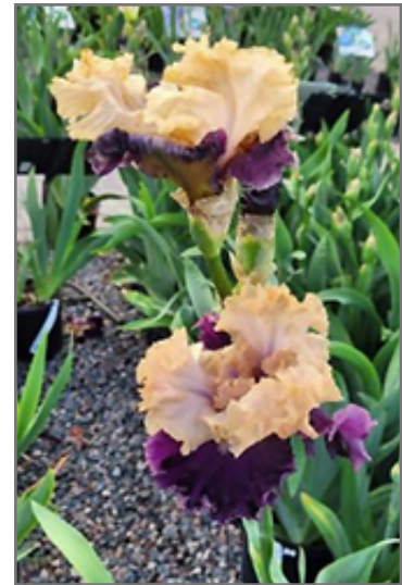
Roaring Twenties Iris flowers