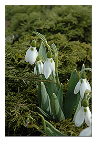
Common Snowdrop flowers

This is a relatively low maintenance plant, and usually looks its best without pruning, although it will tolerate pruning. Deer don't particularly care for this plant and will usually leave it alone in favor of tastier treats. It has no significant negative characteristics.