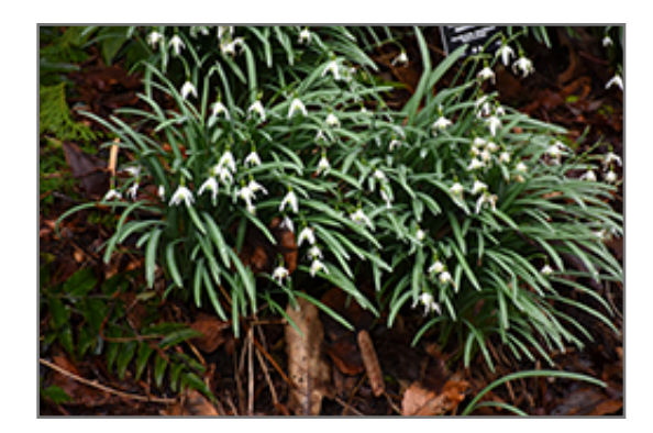
Common Snowdrop in bloom

Common Snowdrop is recommended for the following landscape applications;