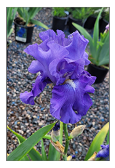
Blue Review Iris flowers Photo courtesy of NetPS Plant Finder

This elegant, reblooming iris produces deep violet-blue blooms with white blazes and orange beards that are tipped in white; a stunning addition to the perennial border; also excellent massed in groupings in the garden; will quickly form dense colonies