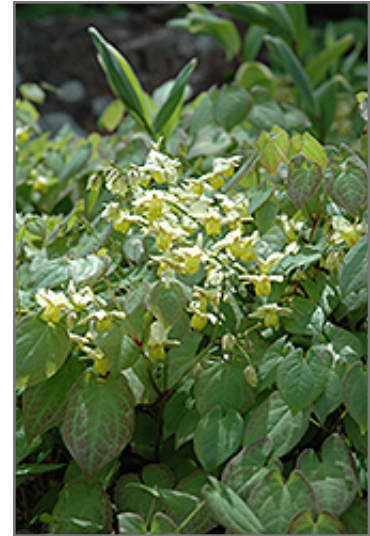
Yellow Barrenwort flowers

Yellow Barrenwort is recommended for the following landscape applications;