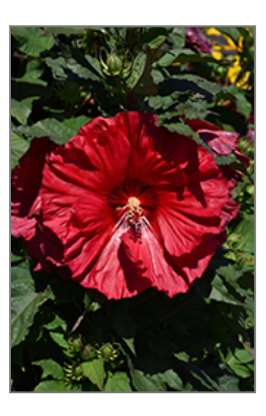
Summerific Valentine's Crush Hibiscus flowers

This bold garden perennial features showy ruffled, large, bright red flowers that are produced at the nodes all up the stems; attractive, glossy, dark-green/bronze leaves; ideal for the mixed garden border or in mass; do not allow to dry to wilting point