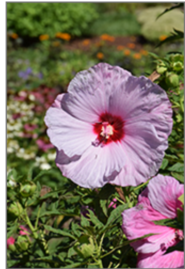
Summerific Lilac Crush Hibiscus flowers