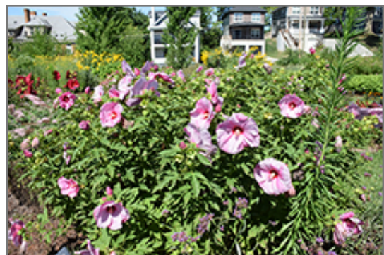
Summerific Lilac Crush Hibiscus in bloom