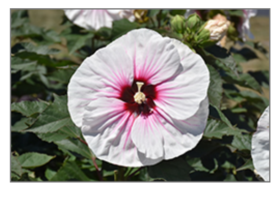
Angel Eyes Hibiscus flowers

Other Names: Rose Mallow, Hardy Hibiscus