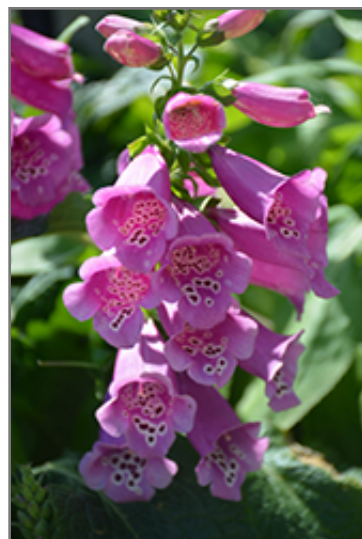
Camelot Rose Foxglove flowers