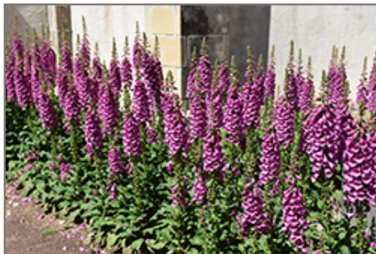
Camelot Rose Foxglove in bloom