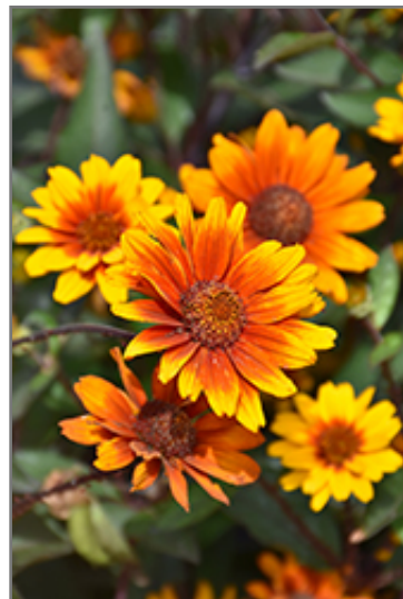
Summer Eclipse False Sunflower flowers

This is a relatively low maintenance plant, and is best cleaned up in early spring before it resumes active growth for the season. It is a good choice for attracting butterflies to your yard. It has no significant negative characteristics.