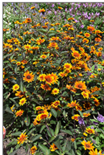
Summer Eclipse False Sunflower in bloom