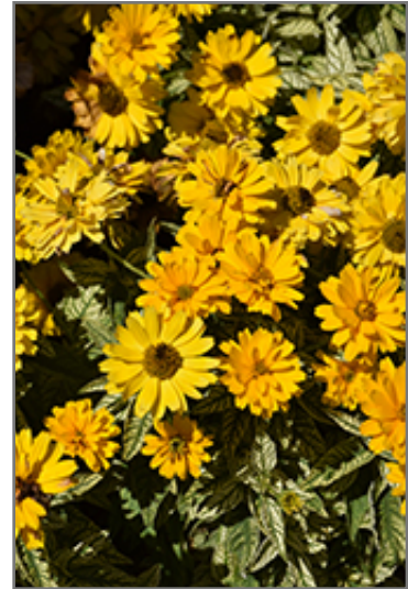
Bit Of Honey False Sunflower flowers

Bit Of Honey False Sunflower is an herbaceous perennial with an upright spreading habit of growth. Its medium texture blends into the garden, but can always be balanced by a couple of finer or coarser plants for an effective composition.