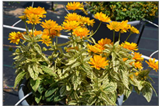
Bit Of Honey False Sunflower in bloom