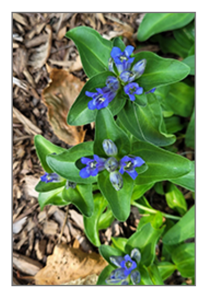
Parry's Gentian flowers

Large, blue urn-shaped flowers appear in summer, atop the stems of this upright plant; part shade is best in hot summer climates, great for containers, rock gardens, or flower borders