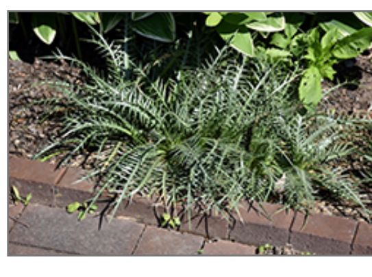
Mexican Sea Holly