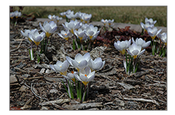
Blue Pearl Crocus in bloom

Blue Pearl Crocus is recommended for the following landscape applications;