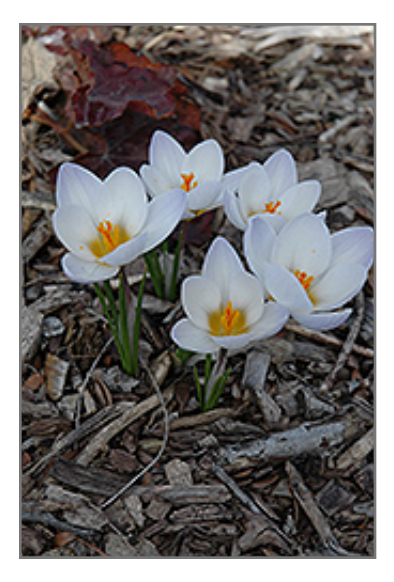
Blue Pearl Crocus flowers

This is a relatively low maintenance plant, and should never be pruned except to remove any dieback, as it tends not to take pruning well. It has no significant negative characteristics.