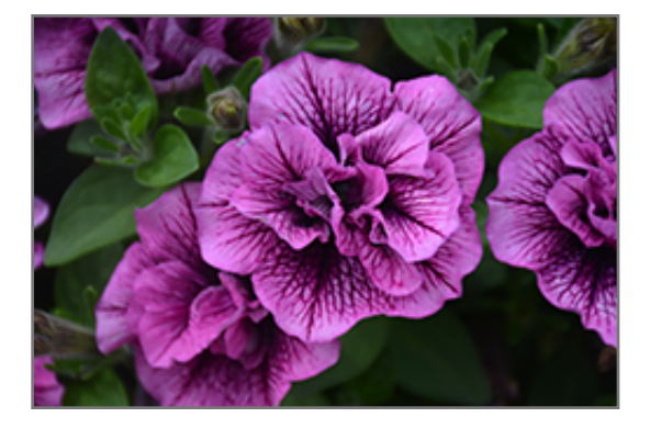
Veranda Compact Double Sugar Plum Petunia flowers

Veranda Compact Double Sugar Plum Petunia is a dense herbaceous annual with a mounded form. Its medium texture blends into the garden, but can always be balanced by a couple of finer or coarser plants for an effective composition.