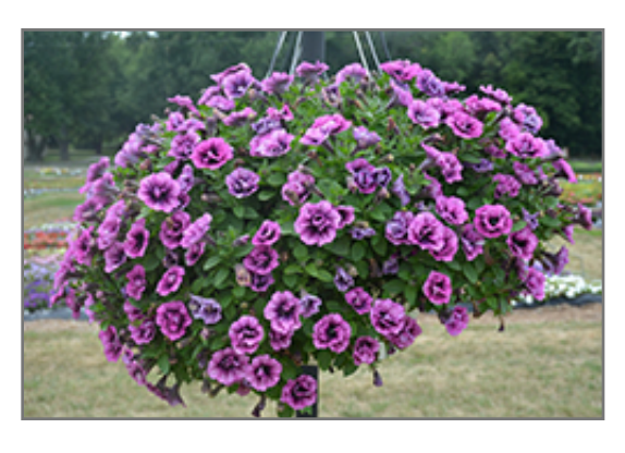
Veranda Compact Double Sugar Plum Petunia in bloom

This plant will require occasional maintenance and upkeep. Trim off the flower heads after they fade and die to encourage more blooms late into the season. It is a good choice for attracting butterflies and hummingbirds to your yard, but is not particularly attractive to deer who tend to leave it alone in favor of tastier treats. It has no significant negative characteristics.