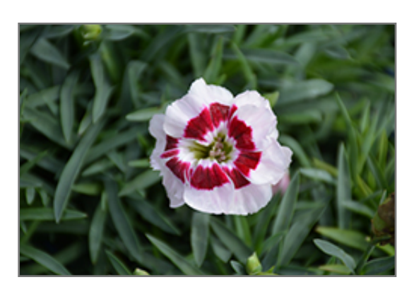
Pretty Poppers Kiss And Tell Pinks flowers

Eye catching blush-pink to white flowers with crimson centers, rise above mounds of fine foliage; great for flower arrangements; deadhead to rebloom; very floriferous with a tidy, uniform habit; sturdy, resilient and easy to grow; excellent in containers