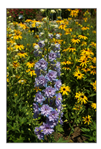
Delgenius Shelby Larkspur flowers