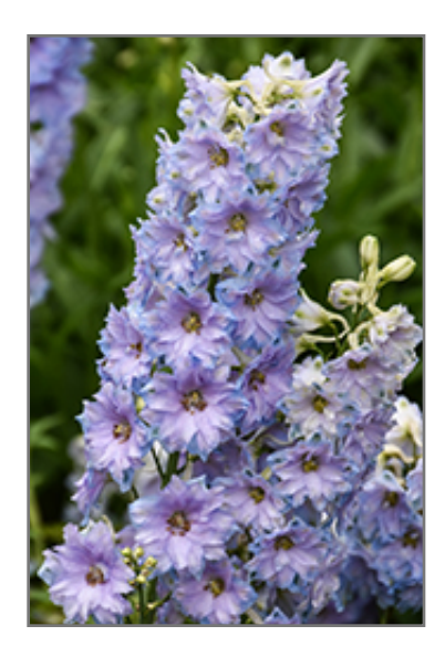
Delgenius Shelby Larkspur flowers