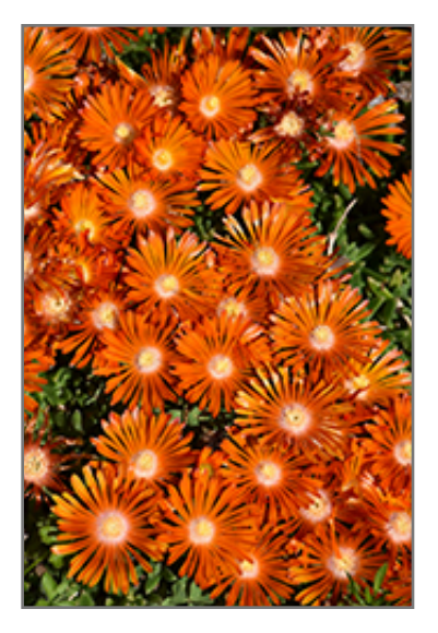
Ocean Sunset Orange Vibe Ice Plant flowers

A low growing succulent, native to South Africa but amazingly hardy in North America; dazzling orange daisy-like flowers with white eyes; green foliage has burgundy overtones in fall; perfect for xeriscapes, rock gardens, screes and sandy soils