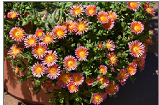
Ocean Sunset Orange Glow Ice Plant flowers