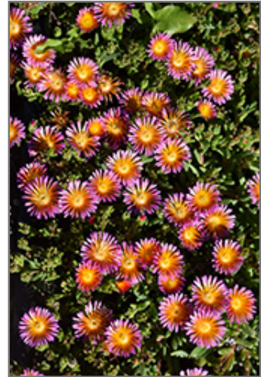
Ocean Sunset Orange Glow Ice Plant flowers

Ocean Sunset Orange Glow Ice Plant is a fine choice for the garden, but it is also a good selection for planting in outdoor pots and containers. Because of its spreading habit of growth, it is ideally suited for use as a 'spiller' in the 'spiller-thriller-filler' container combination; plant it near the edges where it can spill gracefully over the pot. Note that when growing plants in outdoor containers and baskets, they may require more frequent waterings than they would in the yard or garden. Be aware that in our climate, most plants cannot be expected to survive the winter if left in containers outdoors, and this plant is no exception. Contact our experts for more information on how to protect it over the winter months.