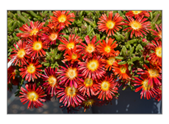
Wheels of Wonder Fire Wonder Ice Plant flowers

A low growing succulent, native to South Africa but amazingly hardy in North America; dazzling orange daisy-like flowers with yellow centers; green foliage has burgundy overtones in fall; perfect for xeriscapes, rock gardens, screes and sandy soils