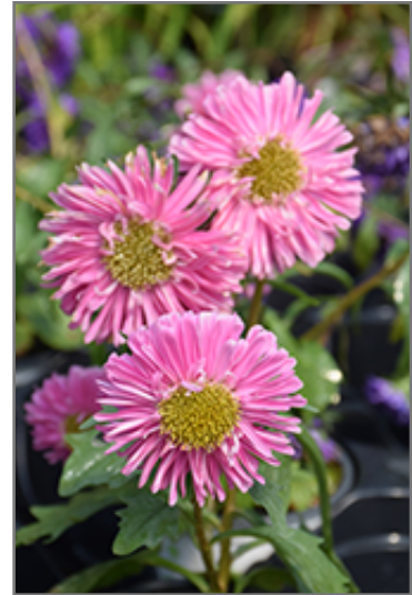
Fan Pink flowers