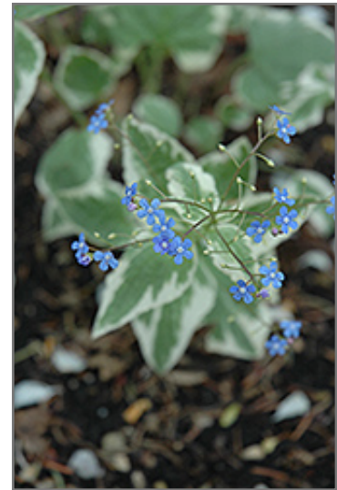
Variegated Siberian Bugloss flowers