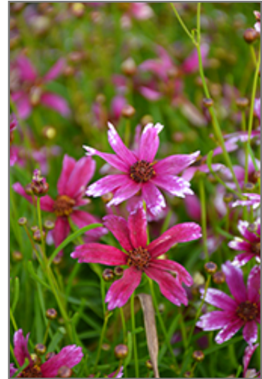
Satin & Lace Razzle Dazzle Tickseed flowers

Satin & Lace Razzle Dazzle Tickseed is recommended for the following landscape applications;