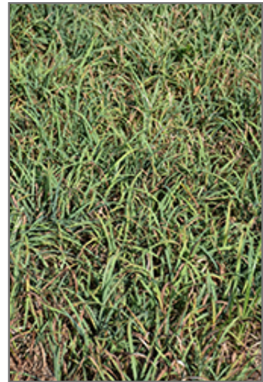
Creeping Sedge