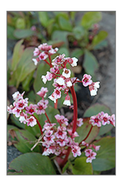
Silverlight Bergenia flowers