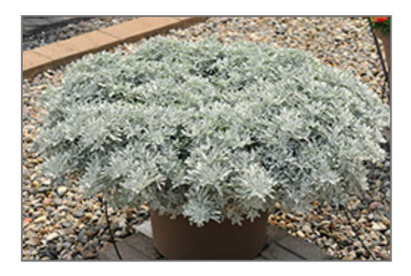
FanciFillers Sea Salt Artemesia

FanciFillers Sea Salt Artemesia is recommended for the following landscape applications;