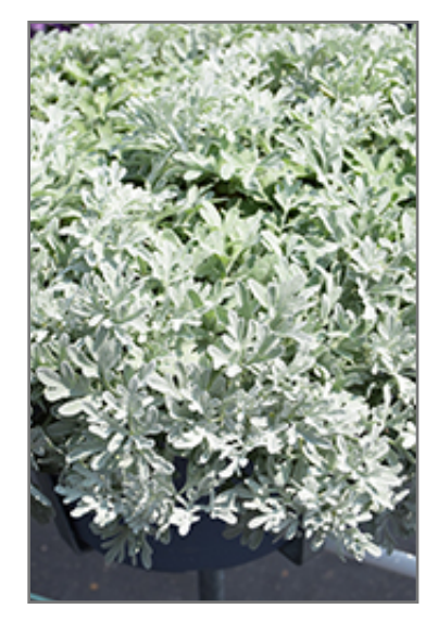
FanciFillers Sea Salt Artemesia foliage

This is a relatively low maintenance plant, and should be cut back in late fall in preparation for winter. Deer don't particularly care for this plant and will usually leave it alone in favor of tastier treats. It has no significant negative characteristics.