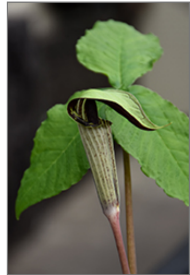
Jack-In-The-Pulpit flowers