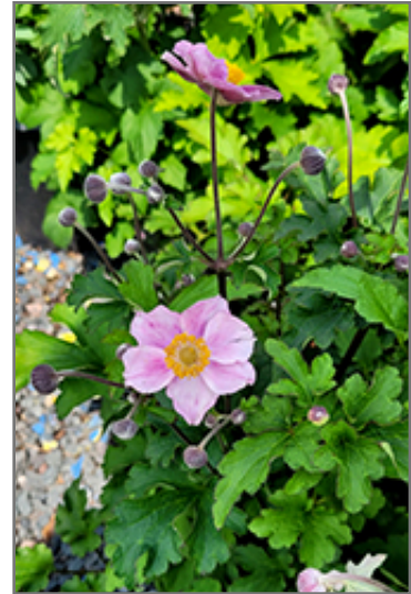
Pink Saucer Anemone flowers