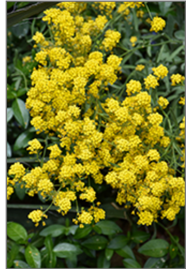
Golden Spring Alpine Alyssum flowers

Golden Spring Alpine Alyssum is a fine choice for the garden, but it is also a good selection for planting in outdoor pots and containers. It is often used as a 'filler' in the 'spiller-thriller-filler' container combination, providing a mass of flowers and foliage against which the thriller plants stand out. Note that when growing plants in outdoor containers and baskets, they may require more frequent waterings than they would in the yard or garden. Be aware that in our climate, most plants cannot be expected to survive the winter if left in containers outdoors, and this plant is no exception. Contact our experts for more information on how to protect it over the winter months.