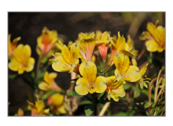
Golden Tiara Alstroemeria flowers

This impressive, hardy variety presents stunning golden-yellow blooms with sage green blotches, burgundy spots, and dramatic coral-orange throats; mounded, crisp green foliage provides contrast; blooms last well as cut flowers