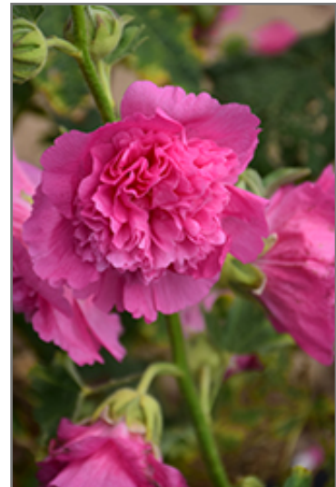
Summer Carnival Rosy Pink Hollyhock fruit

Summer Carnival Rosy Pink Hollyhock is recommended for the following landscape applications;